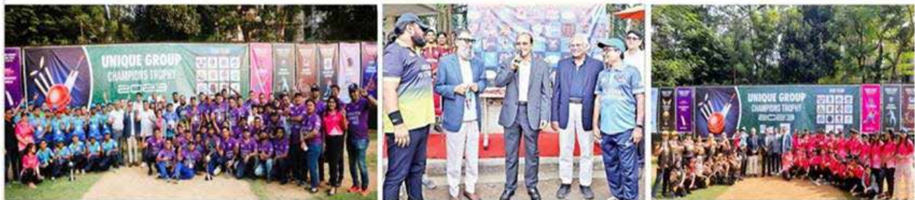
Pic 01: Some magnificent moments the event