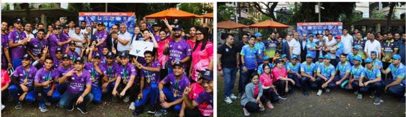
Pic 02: Champion (Sheraton Legends) and Runner- up (HANSA Geniuses) of the tournament